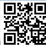
Deb Bewick Community Action Team Volunteer Scan the QR code and watch Deb's story